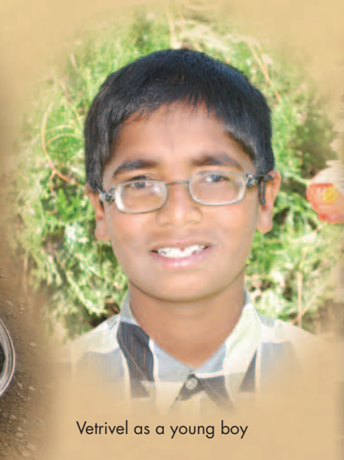
Vetrivel as a young boy