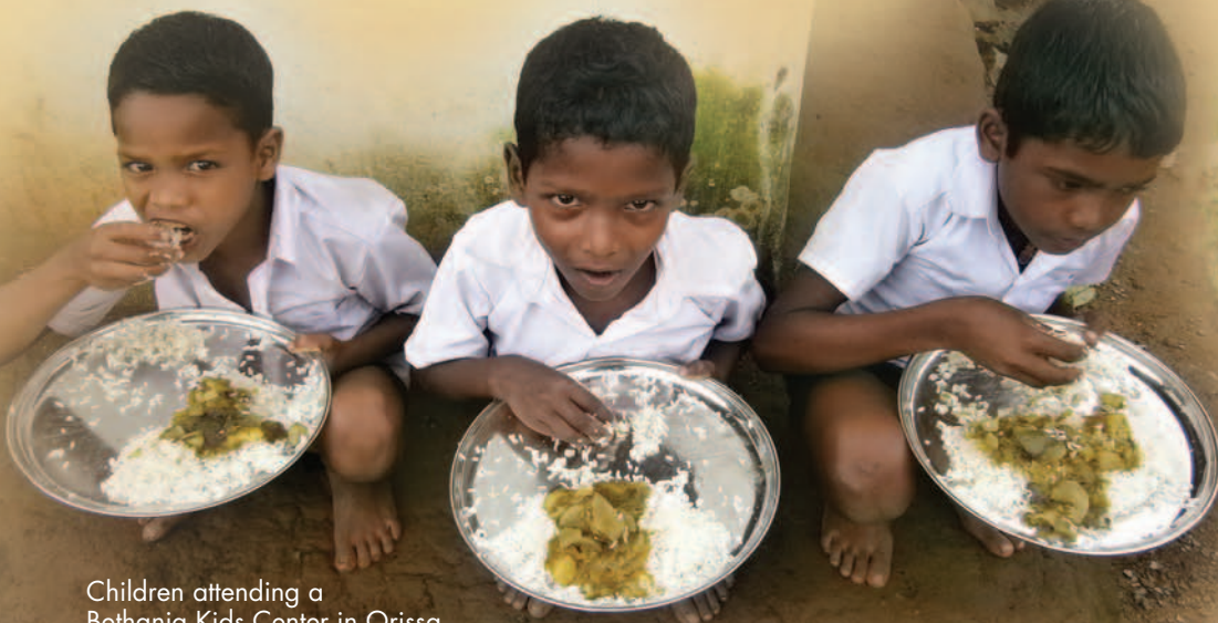
Children attending a Bethania Kids Center in Orissa