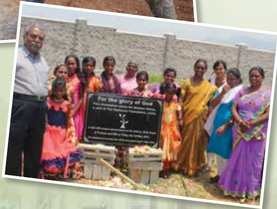
FROM TOP: Repaired guest house; Shalom Home foundation stone ceremony; Boys playing at Dayavu Home